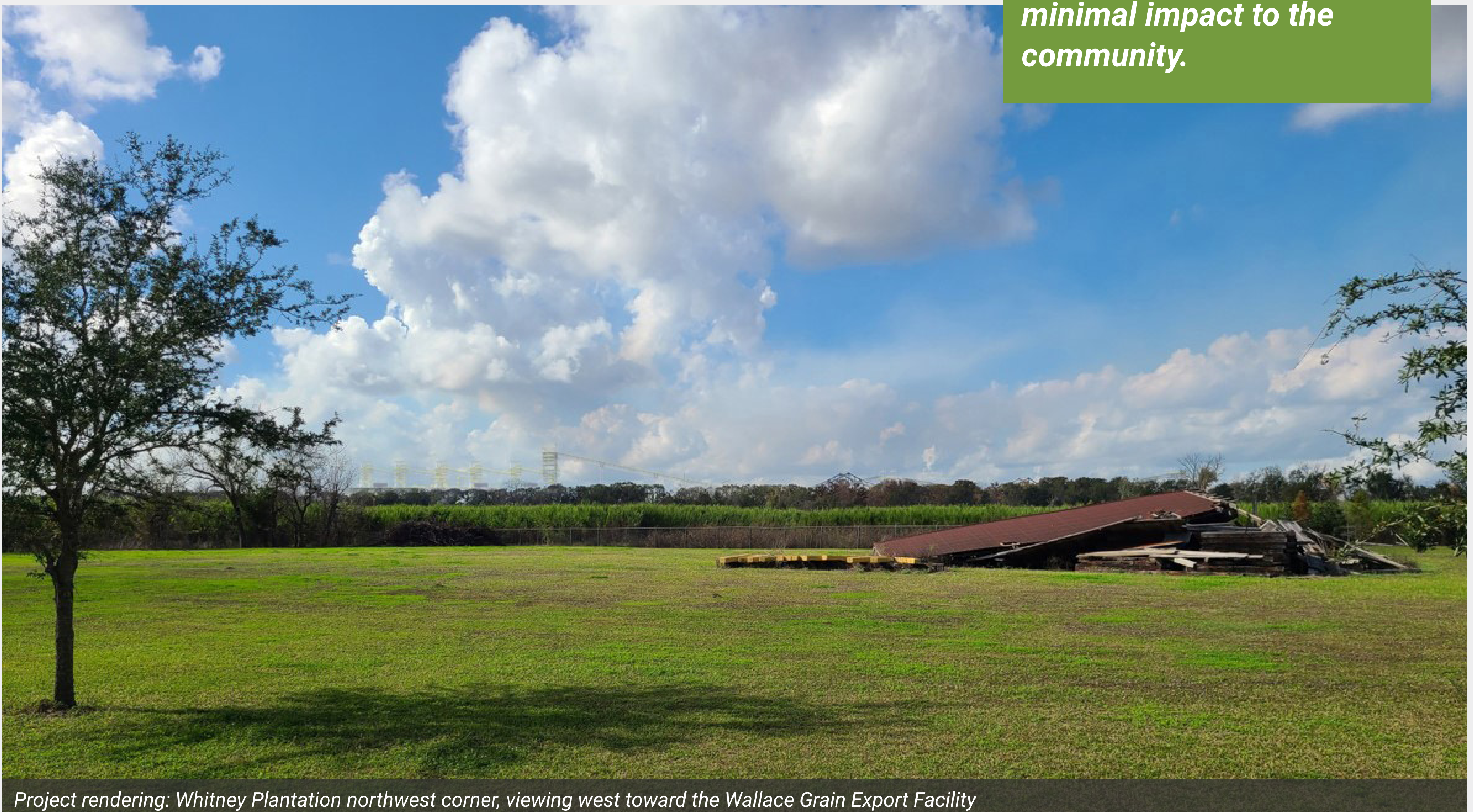
Project rendering: Whitney Plantation northwest corner, viewing west toward the Wallace Grain Export Facility

Greenfield is also prepared to consider mitigation measures to ensure minimal impact to the community.